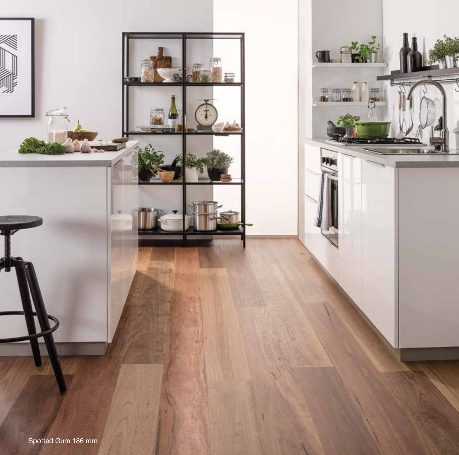
Spotted Gum 186 mm

Note: Variations of colour within a timber species are normal, therefore photographs, samples and displays can only be indicative of the colour range of the timber species nominated. Timber is a natural product and commonly reacts to changes in atmospheric and environmental conditions such as humidity and temperature. This is considered normal.